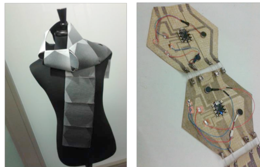
Figure 1. Our modular cotton scarf houses canvas modules with conductive fabric circuitry designed to control heat, vibration, and audio actuations.

http://dx.doi.org/10.1145/2677199.2680565