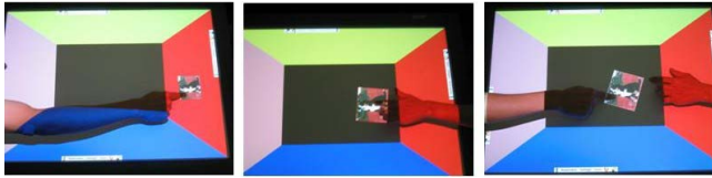
Figure 1. The relocate technique is used to transition a document between personal and public accessibility by moving it from a designated private work zone into a centrally-located shared region.

“relocate” interaction (Figure 1) most efficiently facilitates document transfer and is considered the most natural by users, although all four techniques were quick to learn and had few performance errors.