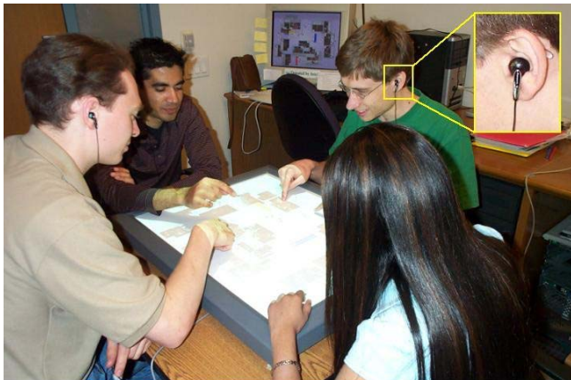
Figure 2. A group uses SoundTracker, a tabletop application with individually-targeted audio.

We have explored the use of individually-targeted audio channels to provide private or customized information to tabletop groupware users [13] (Figure 2). We take advantage of the human ability to more easily parse sounds presented to separate ears [5] by presenting system-generated audio to a single ear (thus allowing group conversation to be perceived contralaterally). This avoids the stifled-conversation problems reported by previous attempts at incorporating personal audio with co-located groupware [1]. Allowing uncoupled exploration of content resulted in increased task parallelization and increased involvement from “shy” group members. Audio privacyware facilitates these benefits of integrating private information with SDG while allowing users to maintain eye contact with group members and avoiding the cognitive overhead of switching between a main display and supplementary personal displays (e.g., PDAs).