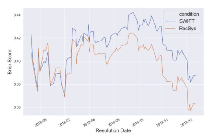
FIGURE 6 The IFP recommender system learns over time the skills and preferences of each forecaster. After 2 months into the experiment, the forecasters who received the recommendations start to consistently outperform the forecasters in the control condition (SWIFT), with a relative improvement that stabilizes around 7%. IFP, individual forecasting problem.

237/19621, 2023, 1, Downloaded from https://onlinelibrary.wiley.com/doi/10.1002/aaai.12085, Wiley Online Library on [26/09/2023]. See the Terms and Conditions (https://onlinelibrary.wiley.com/terms-and-conditions) on Wiley Online Library for rules of use; OA articles are governed by the applicable Creative Commons Licenses