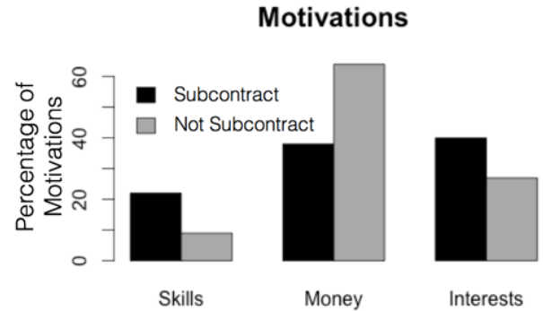
Figure 2. Overview of the motives crowd workers reported for their decisions to subcontract or not subcontract portions of the larger HIT. Sacrificing income was one of the main motives for not subcontracting.

These findings indicate that money was not the only factor in whether primary workers chose to complete subtasks