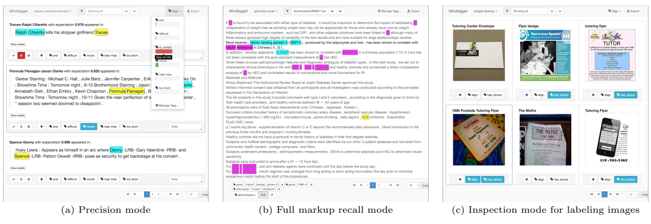
Figure 2: Screenshots of Mindtagger operating in three different modes.

identify possible improvements and assess their potential impact in a principled way.