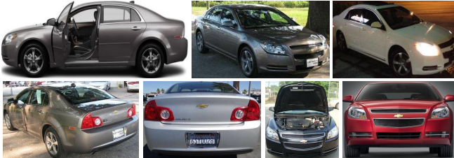
Figure 5. Examples of images for 2008-2010 Chevrolet Malibu sedan ls,lt,base,fleet showing intra class variation in our dataset. In addition to variations in color, background, lighting and pose, doors and trunks can be open or closed and cars can be occluded.

car (e.g. Honda vs. BMW). We know all nodes in one tree to be visually different from all nodes in a different tree. Under the make node is the model (e.g. 3 Series, 5 Series etc. for BMW). Under the model is the body type (e.g. sedan, wagon etc.) and manufactured year and trim (e.g. 330i, 335d, etc.). As noted earlier, nodes under one body type can look the same or different. Each type of car can be visualized as a leaf node in this tree.