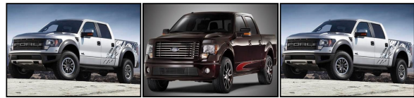
Figure 3. Unlike existing fine-grained image annotation methods, we cannot rely on taxonomy to group cars into visual categories. For instance, a 2011 Ford F-150 Supercrew HD (left) looks the same as a 2001 Ford F-150 Supercrew LL (right) but very different from a 2011 Ford F-150 Supercrew SVT (middle).

Our proposed workflow draws inspiration from prior work in decreasing image labeling cost through crowdsourcing while